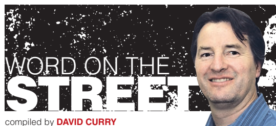
compiled by DAVID CURRY