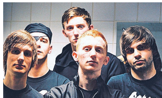
Big crowds: Gallows played to 20,000 fans at Reading.

Carter attributes Gallows spasmodic and high-octane performances to "trying to be as honest as we possibly can – we're not a typical band of 2009. We don't write crunk like 'my girlfriend's an idiot'. We want to write and play music with as much passion and honesty as we can." Despite their sometimes violent dubbed stage act, the Carter brothers are just big softies at heart. They try to separate